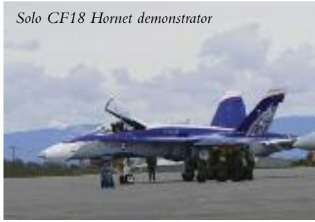
Solo CF18 Hornet demonstrator