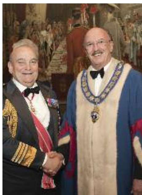
The Master with CDS