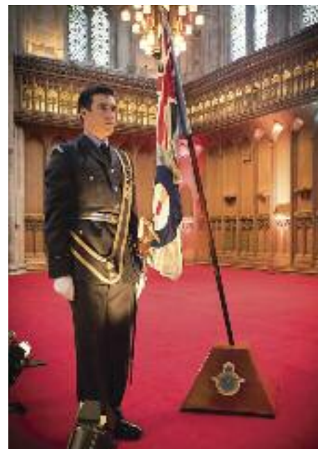
The RAF Colour on parade