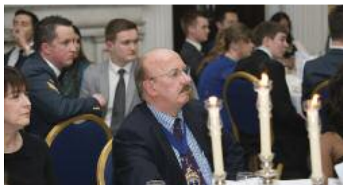
Our Master is rapt