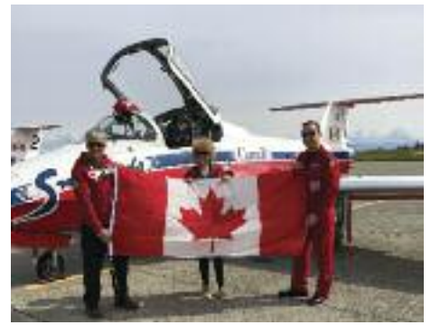
The Canadian flag flown the breadth of the country