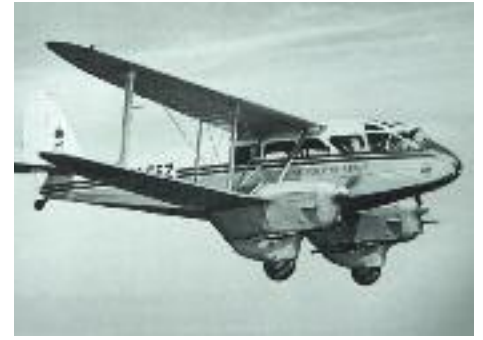
DH Dragon Rapide