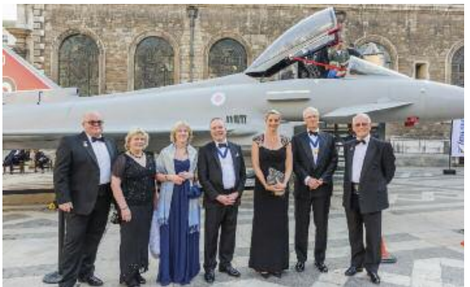
Air Pilots enjoying the pre-dinner sunshine