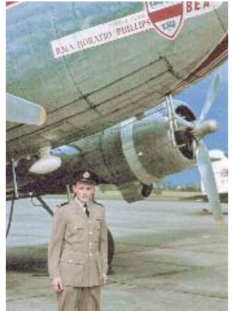
The speaker by a BEA Dak