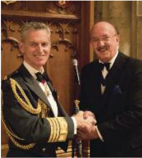
The Master greets CAS