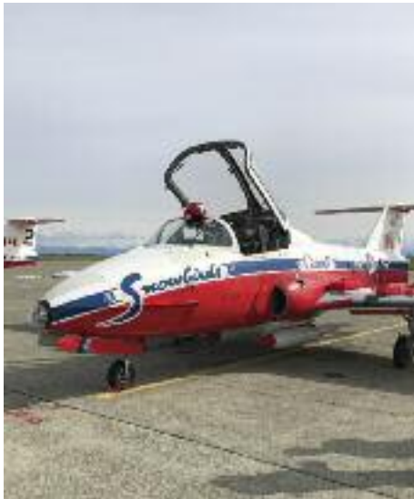
431 Sqn CT 114 Tutor

The tour started with a visit to 407 Squadron. This Aurora-equipped Squadron keeps watch over the Pacific Ocean looking for illegal fishing, migration, drugs and pollution in addition to looking for foreign submarines. After a short briefing on the history of this squadron, we were taken