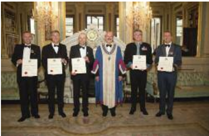
Master Air Pilots with their new certificates