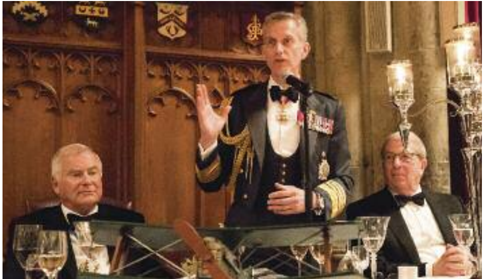
Sir Stephen in full flow